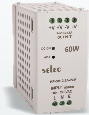
55 x 100 x 105mm