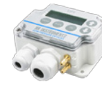
Pressure and flow transmitters