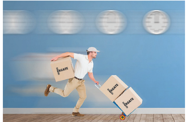
Short delivery times