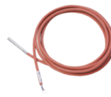
Passive temperature cable and surface sensors