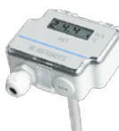
CO 2 and humidity transmitters