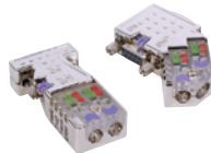
PROFIBUS and PROFINET connectors