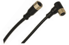
M8 and M12 cables and connectors