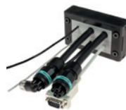
Cable entry systems for pre-terminated cables