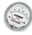
Differential pressure gauges and manometers