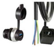
USB and RJ45 connectors