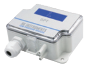
Air quality CO 2 and VOC sensors