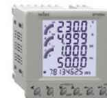
Plug-N-Wire Multifunction Meters