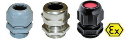
Cable glands, plastic, brass, EMV, ATEX