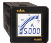
Digital Ammeters and Voltmeter