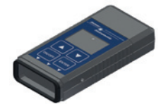
Product labelling and tracking