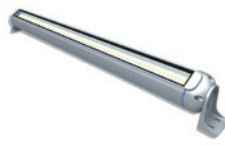
LED machine work lamps