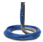
Pre-assembled front connectors