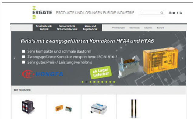
Catalogues and price lists online