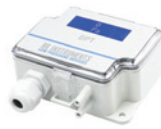
Differential pressure transmitters