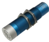
Colour control and measurement