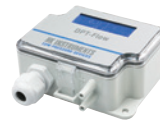
Air flow and velocity transmitters