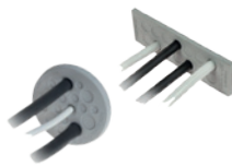
Cable entry systems for cables with and without connectors