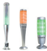
LED signal tower lights