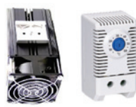
Heaters and thermostats for control cabinets