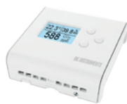
Room operating units